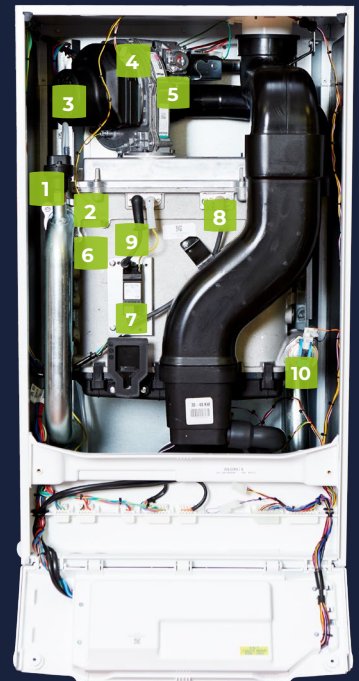
BOILER ASSEMBLY INTERNAL VIEW (40kW MODEL SHOWN)