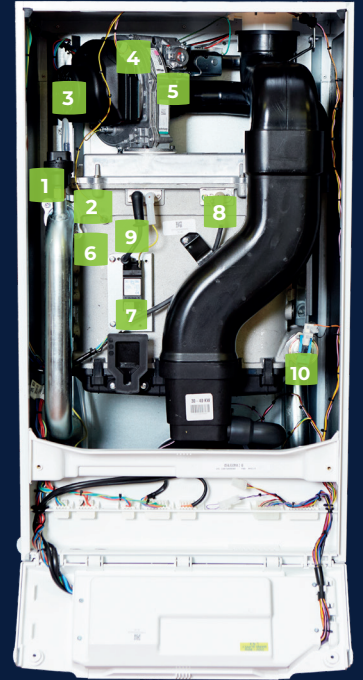
BOILER ASSEMBLY INTERNAL VIEW (40kW MODEL SHOWN)

CLEARANCE BETWEEN MULTIPLE BOILER INSTALLATIONS: 25mm